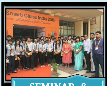
SEMINAR & CONFERENCE